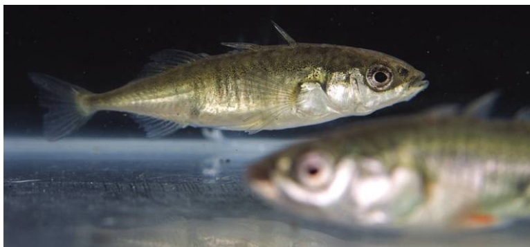
Threespine sticklebacks Gasterosteus aculeatus .

Associate Editor: Jay Stachowicz Editor: Troy Day